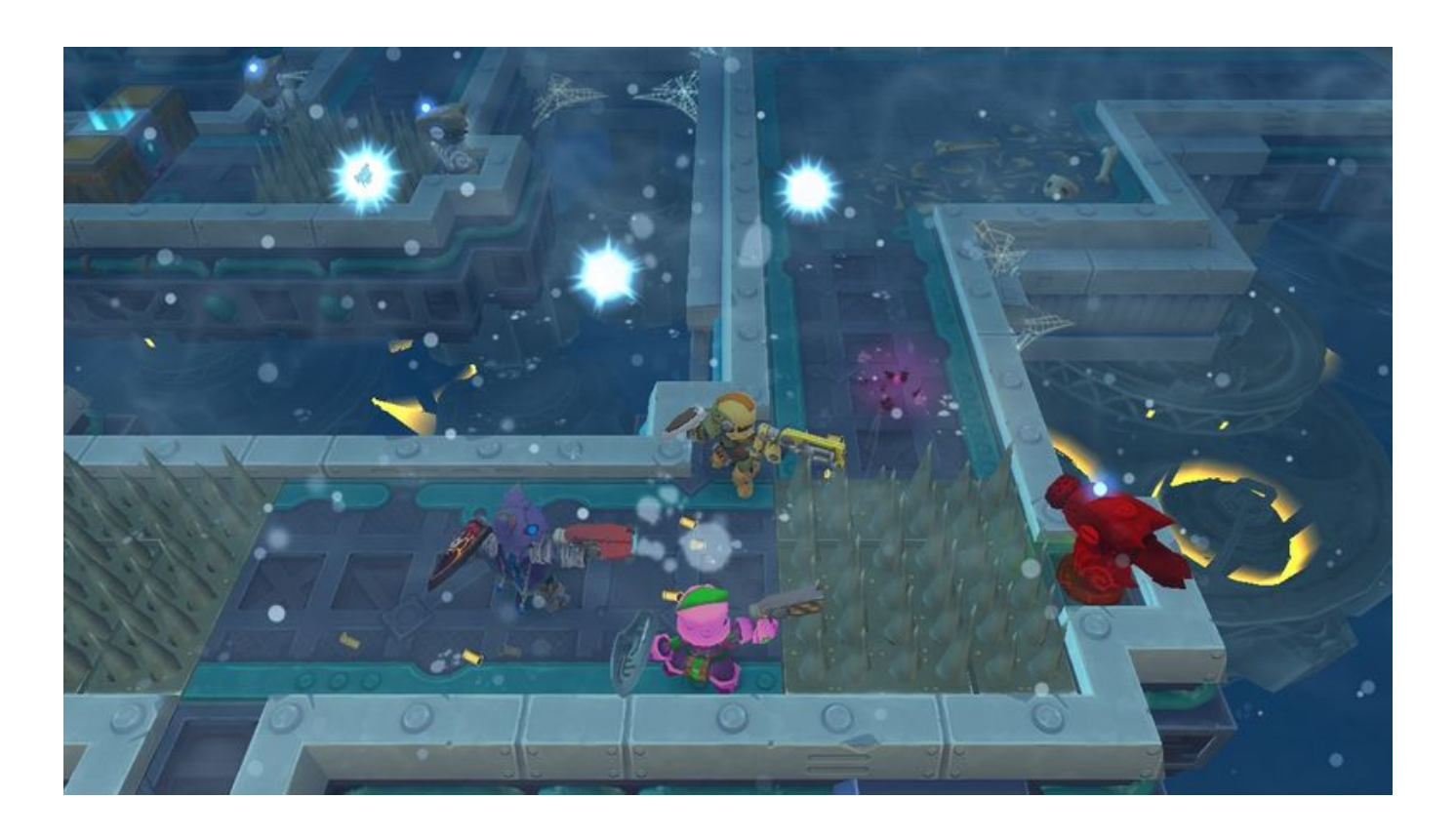
Super Star Path Soundtrack Offline Activation Keygen

Download ->>->> <a href="http://bit.ly/2SKYSRU">http://bit.ly/2SKYSRU</a>